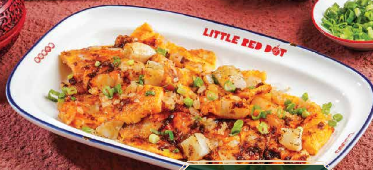
WHITE CARROT CAKE ... 35k