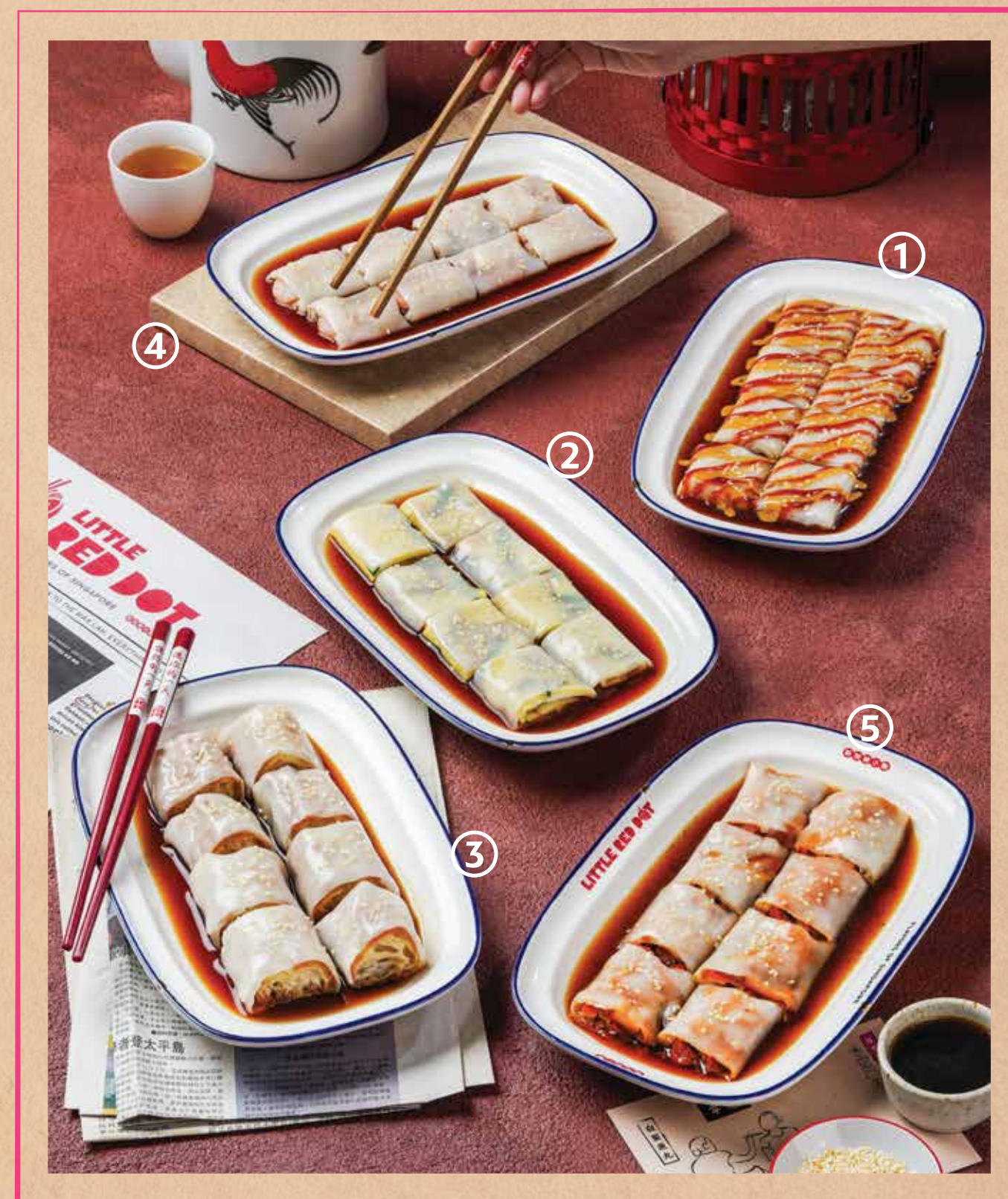
① CHEONG FUN (PLAIN) ... 22k