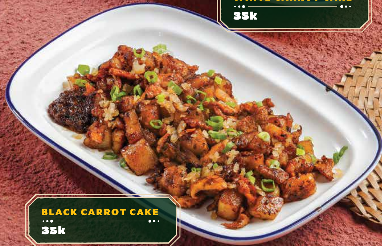
BLACK CARROT CAKE ... 35k